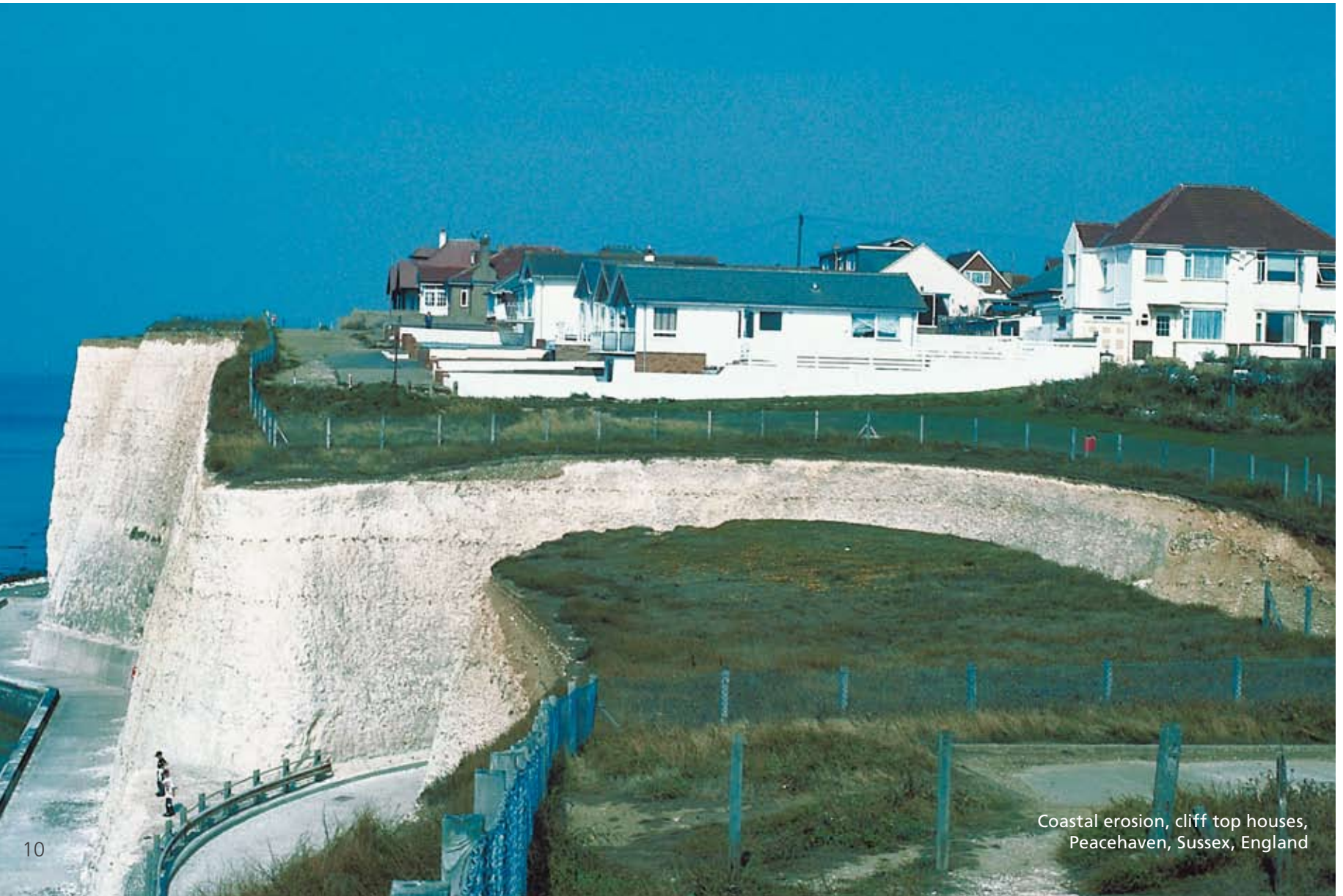
Coastal erosion, cliff top houses, Peacehaven, Sussex, England